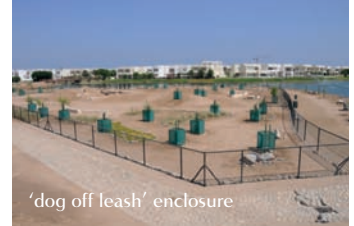
'dog off leash' enclosure