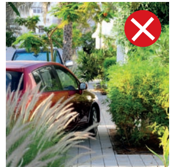
Above is an example of where a driver has obstructed the pavement

To keep your neighbourhood pedestrian friendly and safe for children we recommend parking your car parallel to the pavement with two wheels on the pavement and two wheels on the road. Even with large 4x4s there will still be plenty of room for passing traffic.