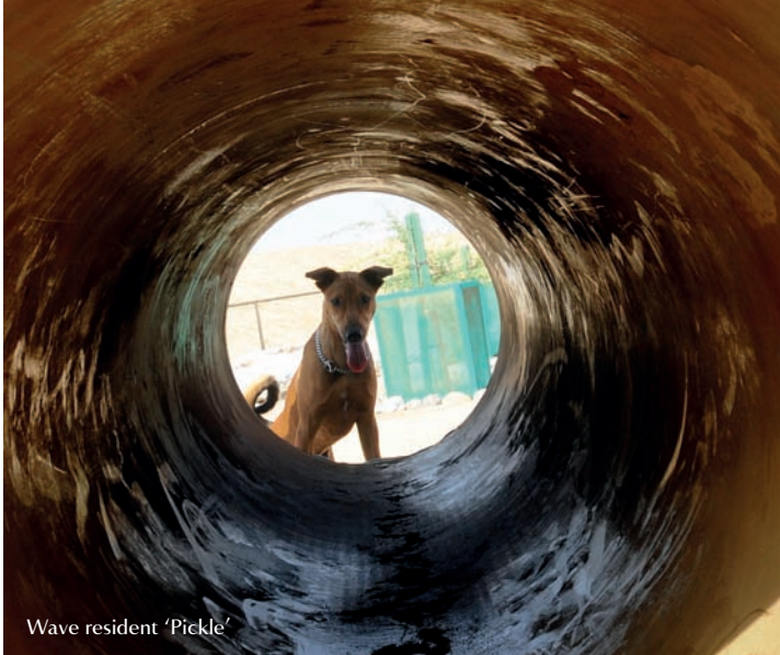
Wave resident 'Pickle'