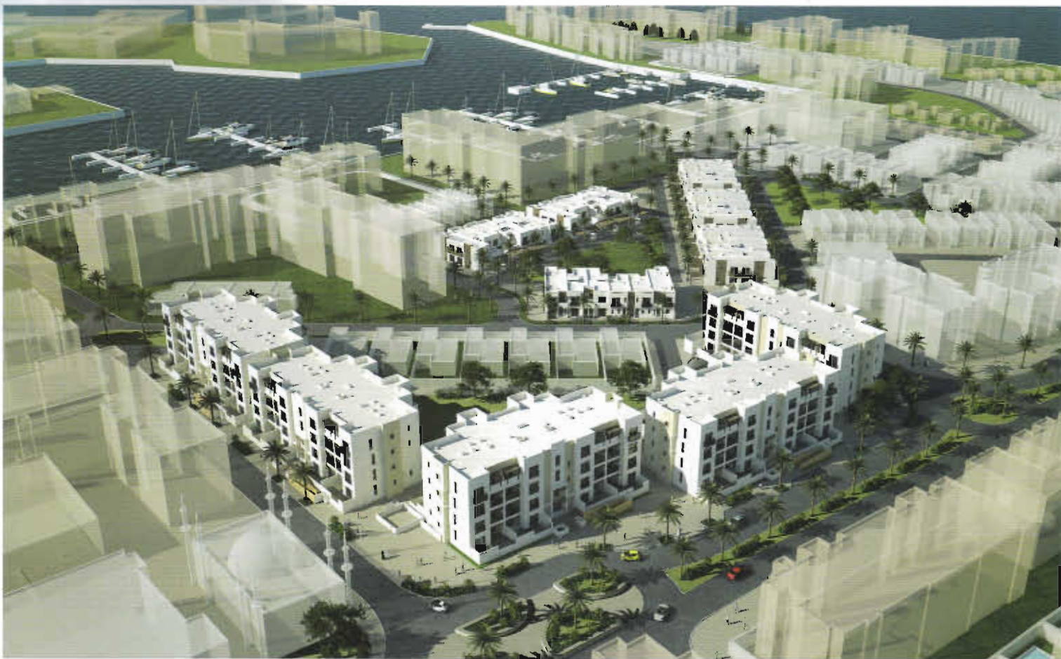
NEEM townhouses at Al Marsa Village