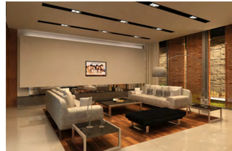
~ Interior ~