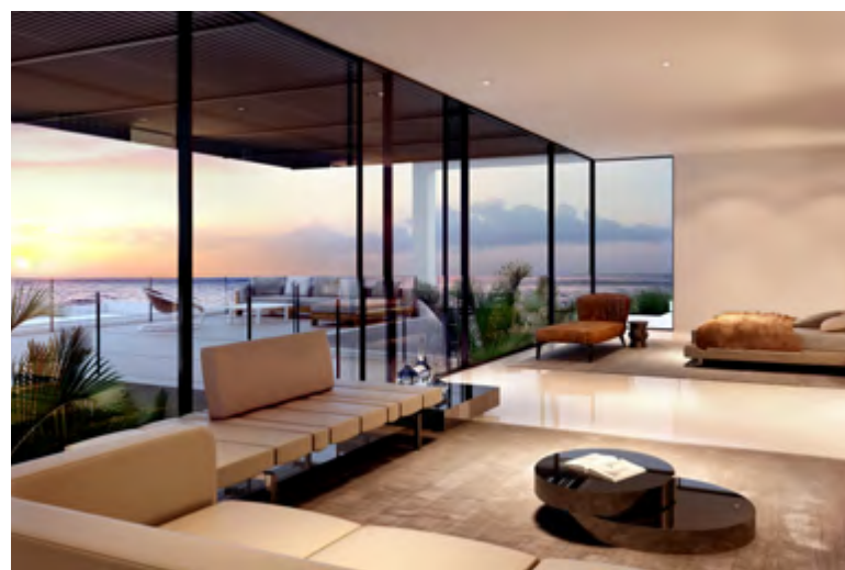
~ Master Bedroom ~

Subtle transitions from green courtyards to living spaces ensure that rooms become increasingly private the further you enter the villa. The elegant multi-level interiors are designed as a contemporary family villa, blending different textures and subtle tones to create a sophisticated fusion of traditional Arabic and modern design elements.