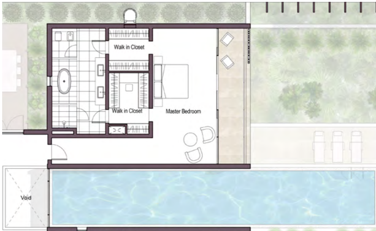
~ Bathroom Option 1 ~