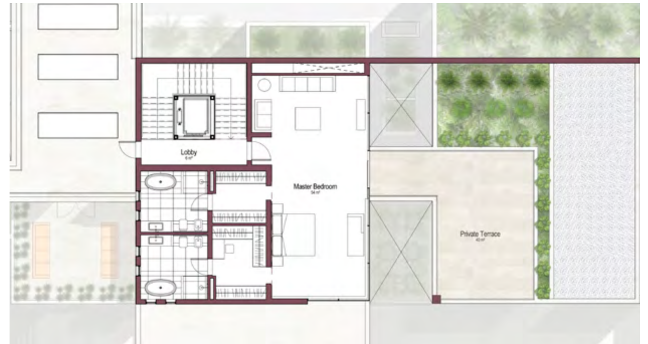
~ Bathroom Option 2 ~