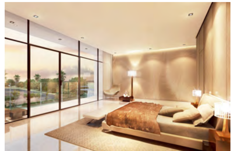
~ Master Bedroom~