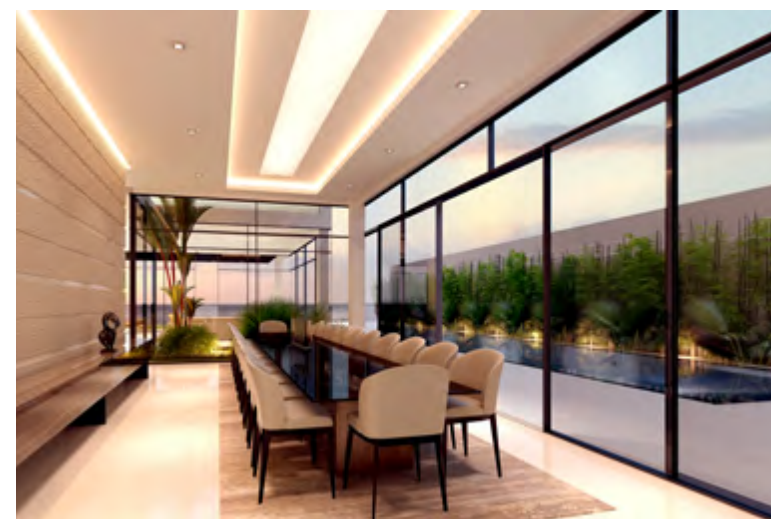
~ Dining ~