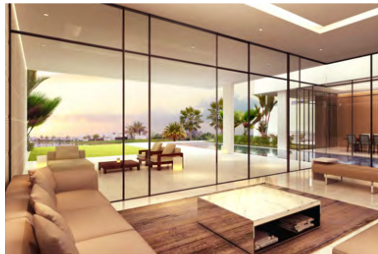
~ Living Area ~

The kitchen and family lounge areas flow to the sunken outdoor seating space, which is enveloped by a central infinity pool. The private ensuited bedrooms are located on the first floor, connected via a series of bridges, to provide privacy throughout and not to obstruct the playful flow of light filtering through a contemporary palm frond roof. The master suite enjoys panoramic views, having its own indoor/outdoor spa or alfresco seating area for ultimate relaxation and tranquillity.