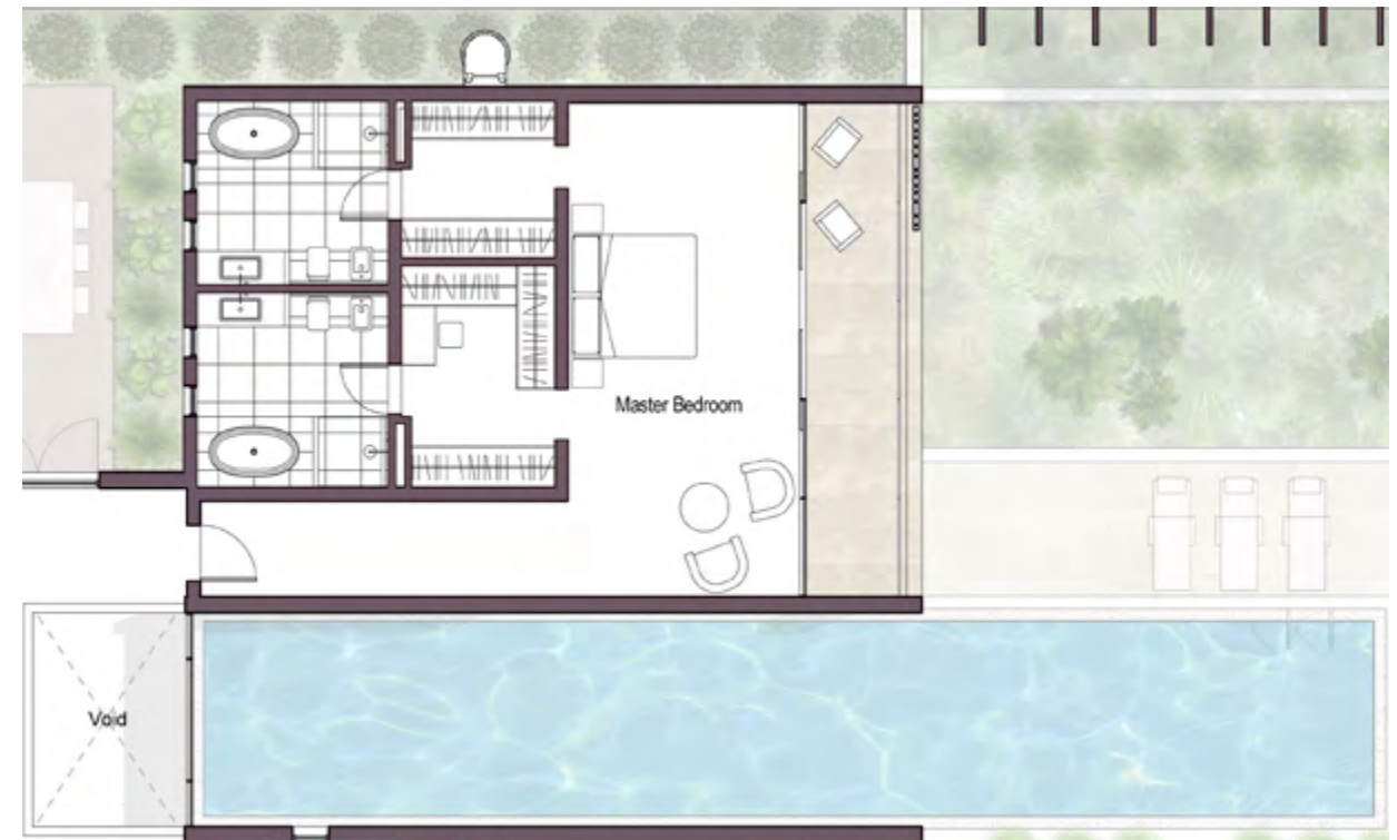
~ Bathroom Option 2 ~