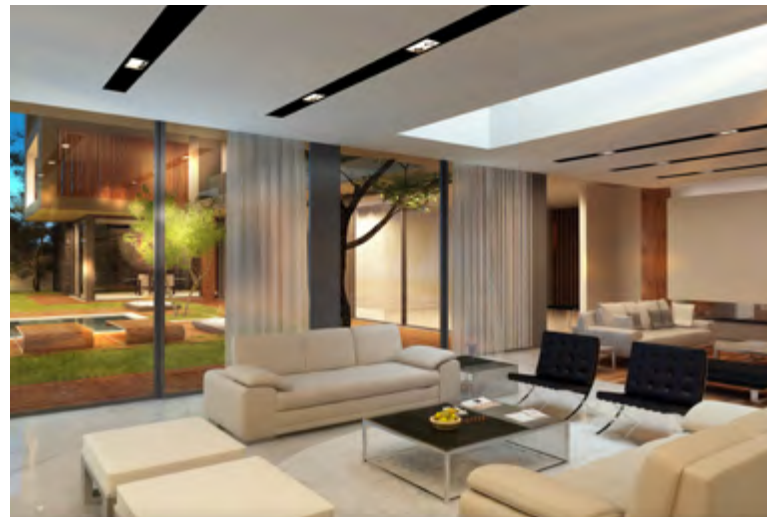
~ Living Area ~

The villa consists of transitional building elements from natural stones to timber and white wash walls creating an authentic yet contemporary feeling. The private internal spaces connect with a seamless fluidity as nature intended generating a series of diagonal perspectives, transparencies, panoramic views and visual impacts between the exterior and the interior.